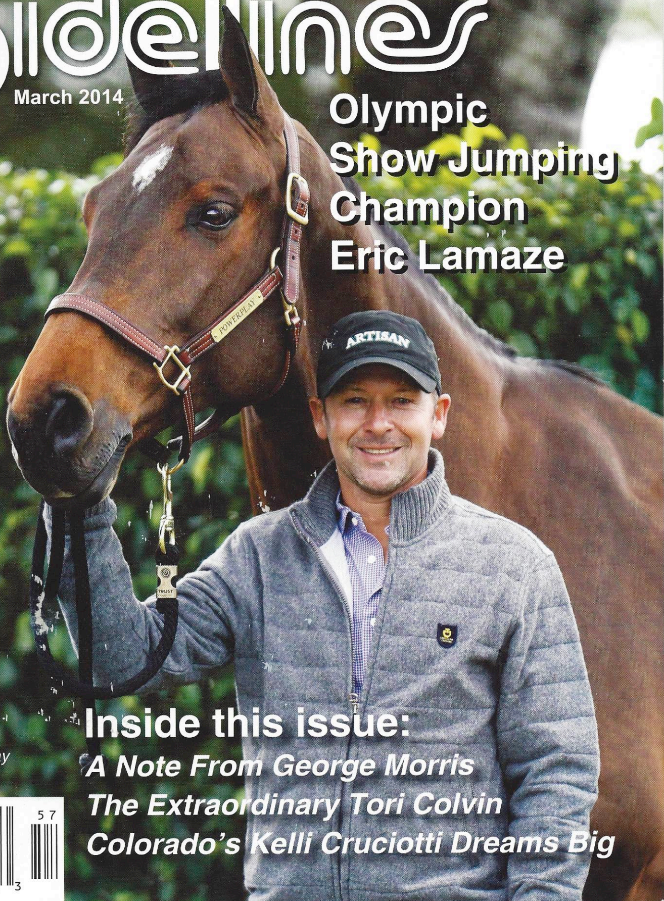
Eric Lamaze and Powerplay

Olympic Show Jumping Champion Eric Lamaze